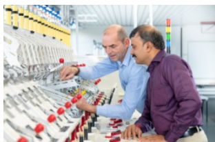
Fig. 2: Comprehensive customer service for mechanical and electronic repairs. ID: 98181