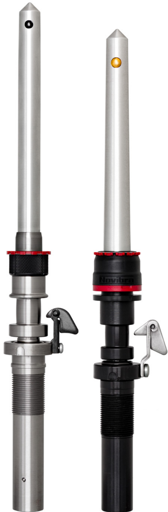
NASA HPS 68 with EASYdoff