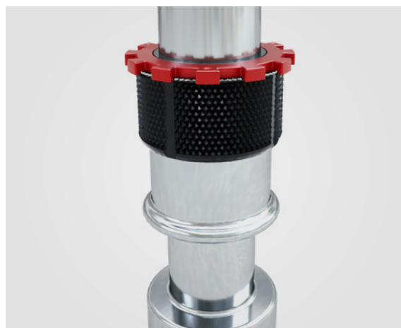
EASYdoff: replaceable, modern design suitable for any machine type