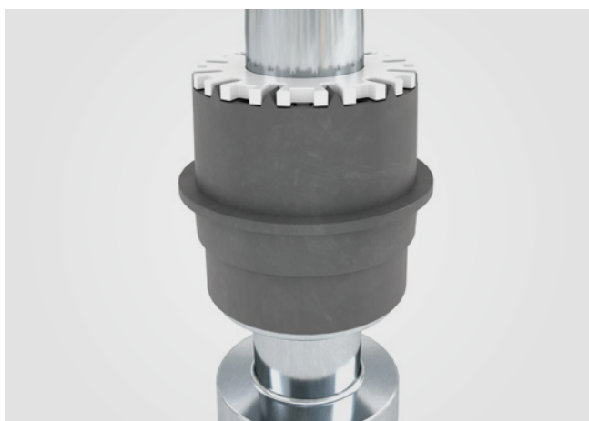
SERVOgrip: replaceable, genuine doffing without underwinding, exclusively for Rieter ring spinning frames