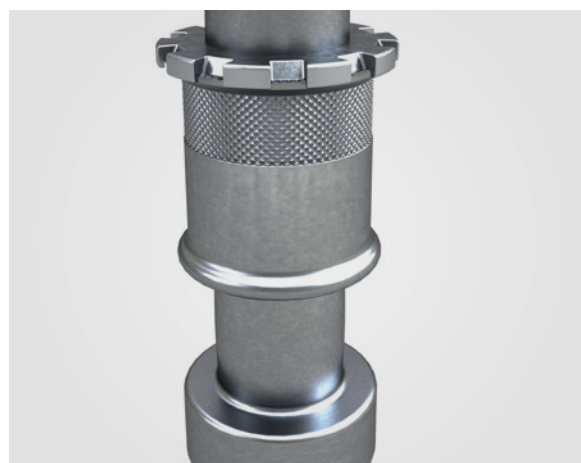
Steel cutter: catching and cutting crown suitable for any machine type