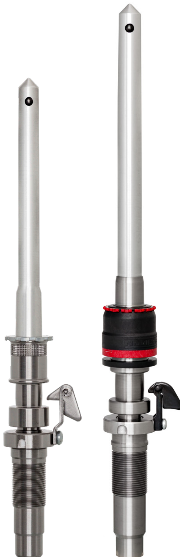
HPS 68 with steel cutter