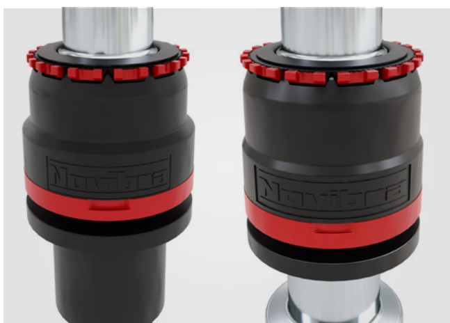
CROCOdoff and CROCOdoff Forte: replaceable, genuine doffing without underwinding, self-cleaning, suitable for any machine type

The versatility of the Novibra portfolio is also reflected in the wide range of spindle crowns. Starting from catching and cutting crowns – based on the well-known 3-underwinding system – to modern clamping crowns, with the advantage of reduced maintenance and cleaning. Novibra offers various crown designs ranging from modern EASYdoff to sturdy steel crowns and from SERVOgrip to self-cleaning CROCOdoff.