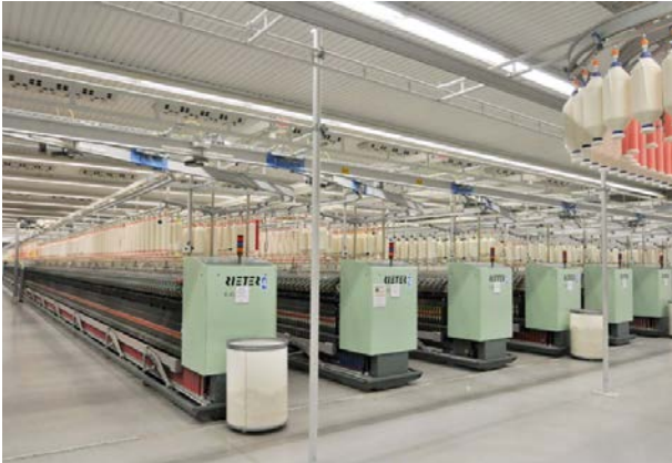
Polopique's machine park of ring spinning machines

Polopique is now able to cover the requirements of the fashion market in almost every respect. New blends allow for applications that were never known before. New designs are highly in demand in this market. The very low hairiness results in better pilling characteristics and therefore higher longevity of the garment.