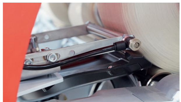
The Smartjet power nozzle – in the doffer – increases the success rate of upper yarn searching even further.