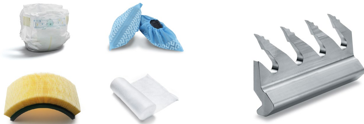
An exemplary assortment of end products

Nonwoven producers using Graf's card clothings benefit from more than 100 years of experience and the resulting innovative power. We understand our business partners' needs in the daily challenges they face, and they motivate us to offer solutions that make them successful.