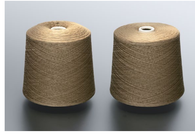
Package without Variopack FX (left side), package with Variopack FX (right side)

Modern sensor technologies, monitoring and autocalibration functions as well as intelligent processes have been developed and integrated into the Autoconer to be more gentle, more efficient, more precise, and more flexible. This fulfills the increasing demands of the wool business regarding quality, flexibility, sustainability, and operator independency.