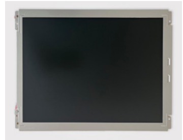
LCD panel Touch panel

The unresponsive touch panel with faded LCD gets replaced by new components to ensure proper function of the machine interface. Additionally, the battery power circuitry modified for better data retention. The use of original parts helps restore the original performance. An authorized Rieter repair service center can carry out the preventive repair service of the operating unit.